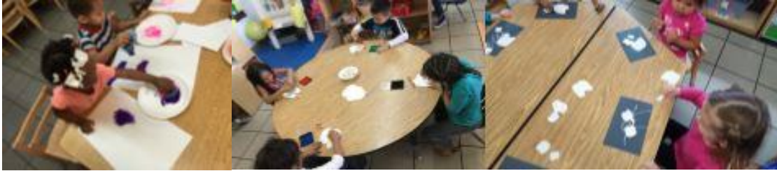
Sponge Paint Collage